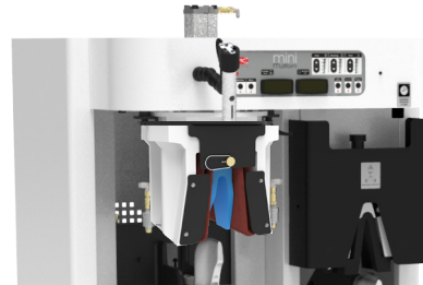
1 Hot - 1 Cold Station With Airbag (no Flanging)